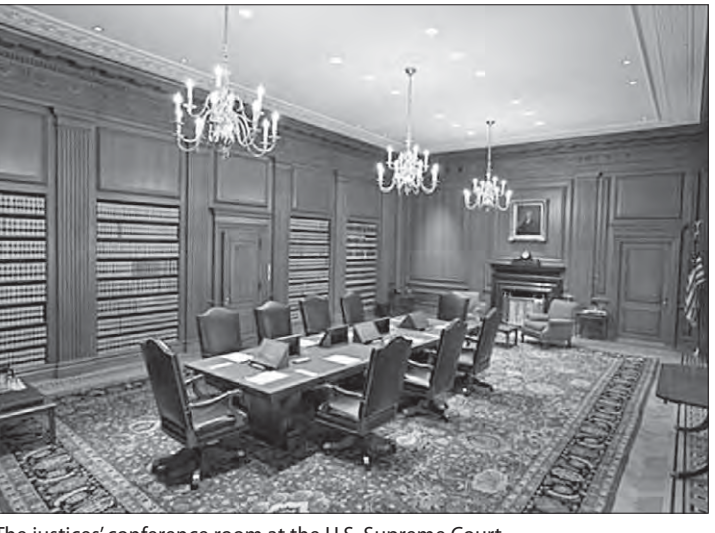
The justices' conference room at the U.S. Supreme Court

A trial judge had dismissed the lawsuit, which alleges that Smith & Wesson Brands Inc.; Sturm, Ruger & Co.; and others deliberately design and market military-style weapons sought by drug cartels in Mexico and make certain distribution choices to profit off the illegal market. The First Circuit agreed that the federal 2005 Protection of Lawful Commerce in Arms Act shields the firearm manufacturers from civil lawsuits brought by foreign governments for harms that occur abroad. But it also said the law doesn't provide gun makers immunity from claims that they facilitated the illegal sale of firearms. In another petition from Jones Day, brands such as Smith & Wesson, Glock, and Colt have told the Supreme Court that Mexico is trying to hold them liable for "how the American firearms industry has openly operated in broad daylight for years." "In Mexico's eyes, continuing these lawful practices amounts to aiding and abetting the cartels," they wrote in a petition filed April 18. "Mexico's suit has no business in an American court."