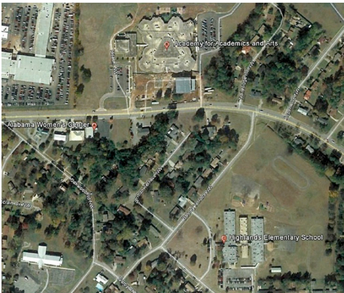
The Huntsville clinic (A) and the two schools, the Academy for Academics and Arts (B) and Highlands Elementary School (C). Pl. Ex. 31 (excerpt).

The Academy for Academics and Arts sits diagonally across a five-lane street from, and to the east of, the Huntsville clinic. Published newspaper articles report that some parents have complained about the presence of