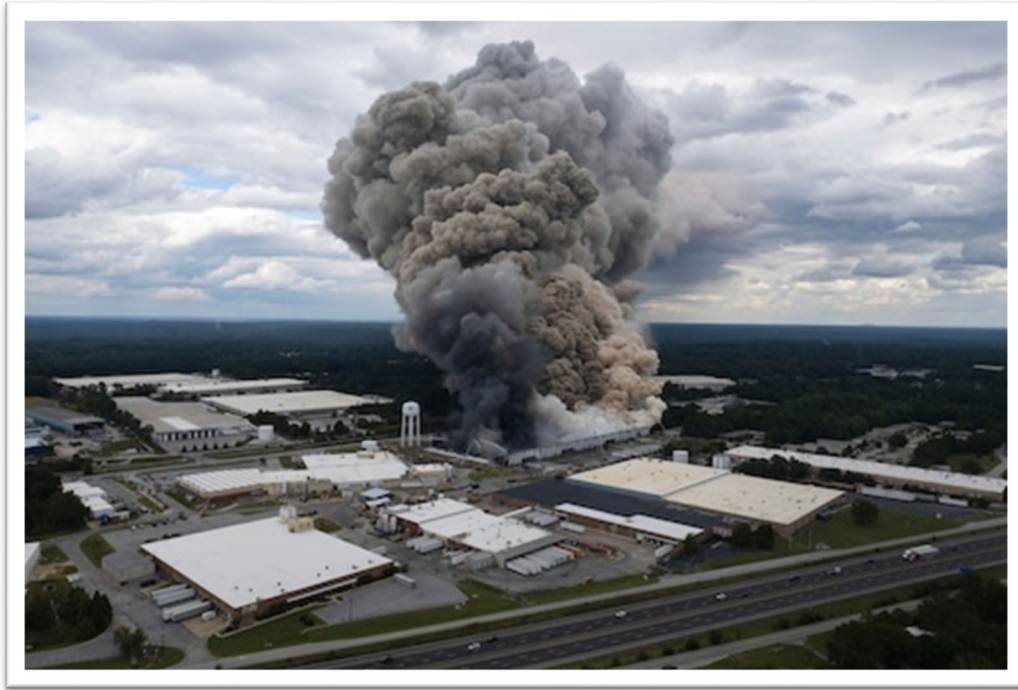
Figure 1 4

26. BioLab did not have an adequate fire protection system in order to quickly and effectively extinguish fires at their facility while also avoiding causing dangerous chemical reactions with water-reactive chemicals.