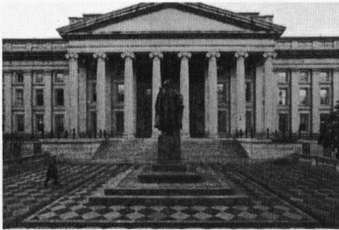
The Office of Financial Research is an arm of the Treasury Department and depends on it for budgeting.