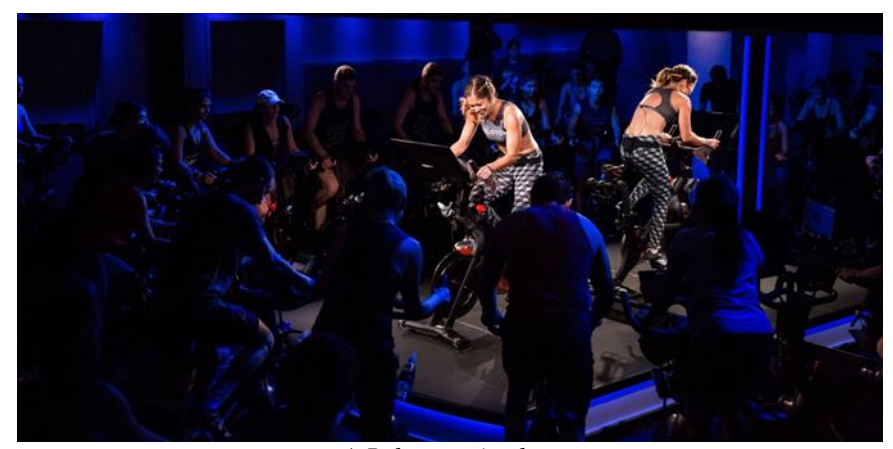
A Peloton spin class

14. Spin bikes have become immensely popular in recent years because of the community and motivation provided by spin classes. These classes are typically held at a gym or workout studio, where multiple spin bikes are placed in a room, usually close together, with an instructor in front: